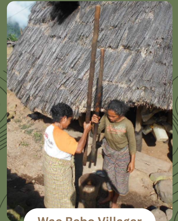
Wae Rebo Villager