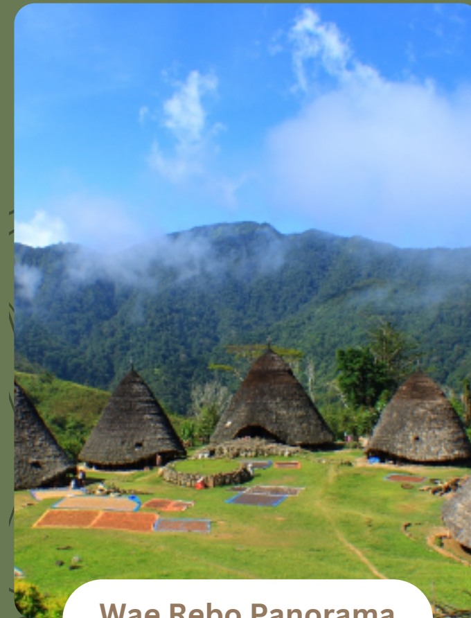
Wae Rebo Panorama