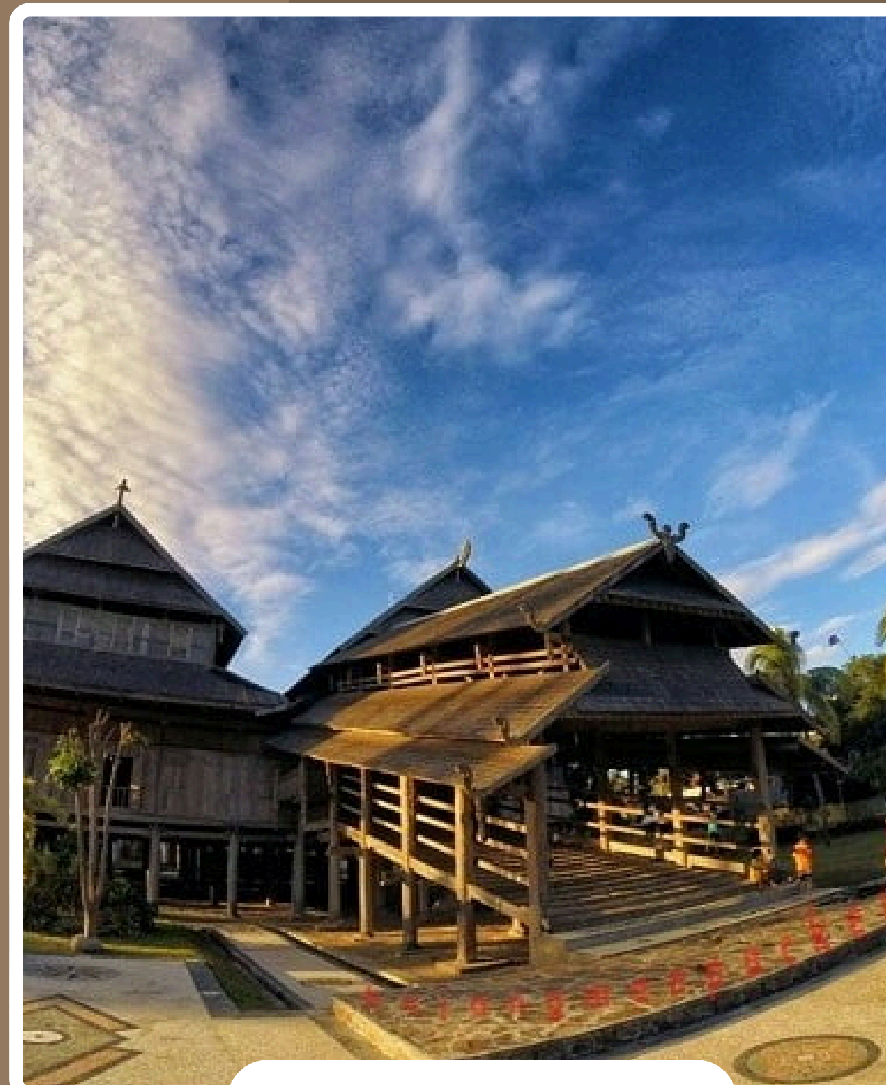
Istana Dalam Loka