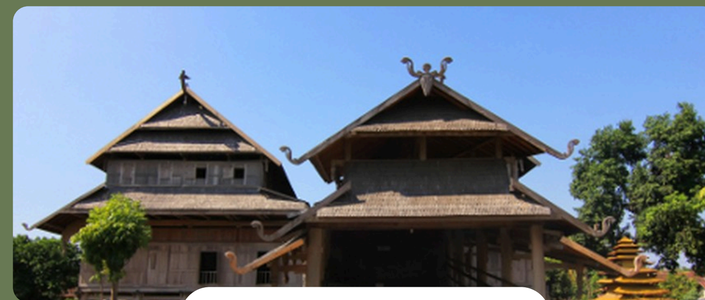
Istana Dalam Loka