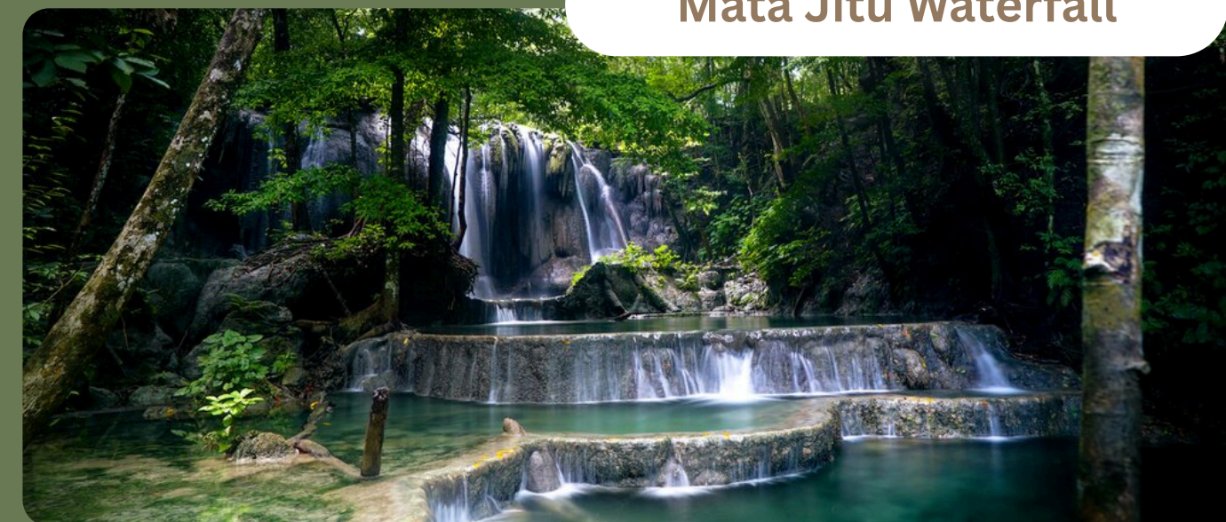
Mata Jitu Waterfall