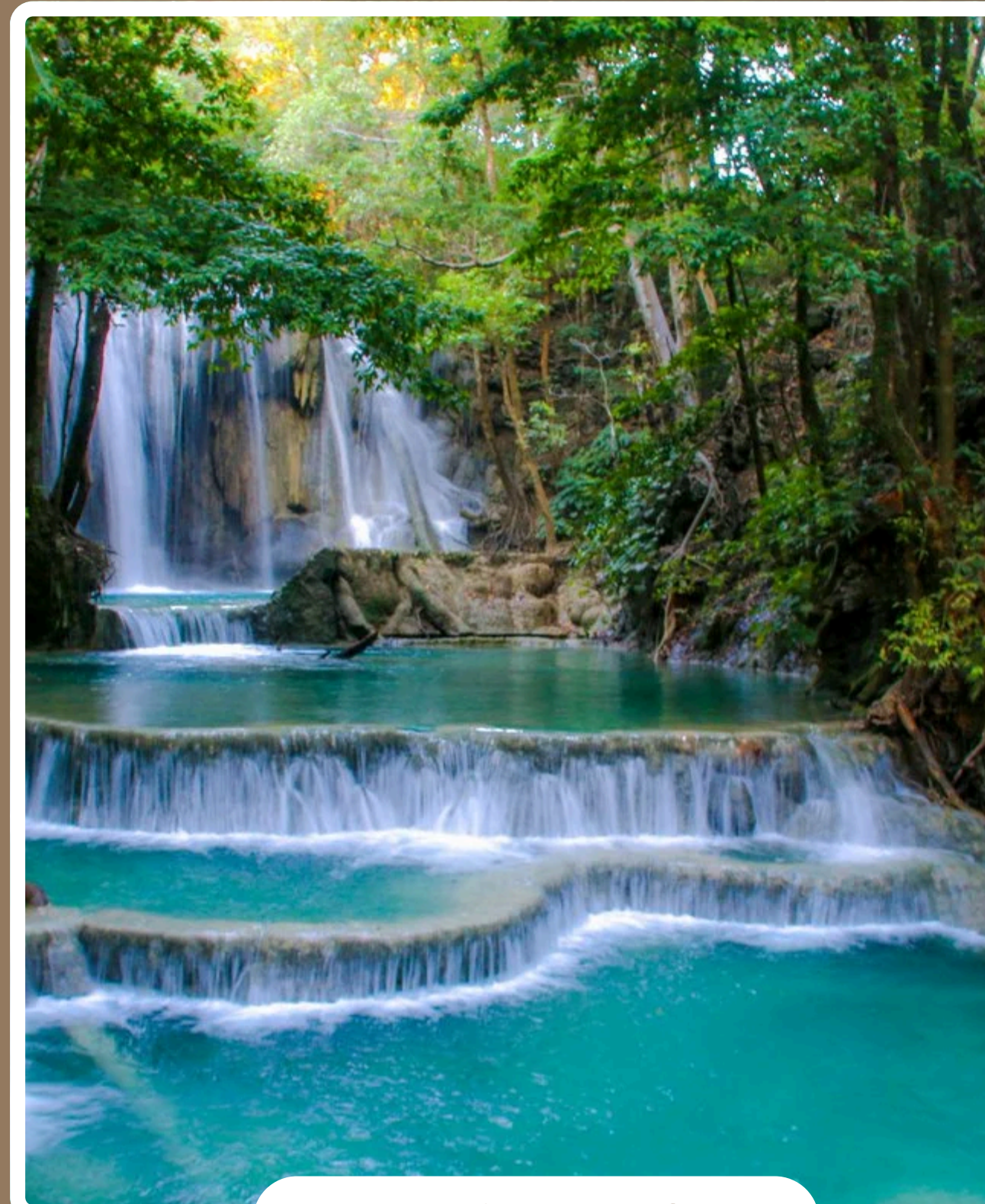
Mata Jitu Waterfall

Meals included : Breakfast, Lunch & Dinner