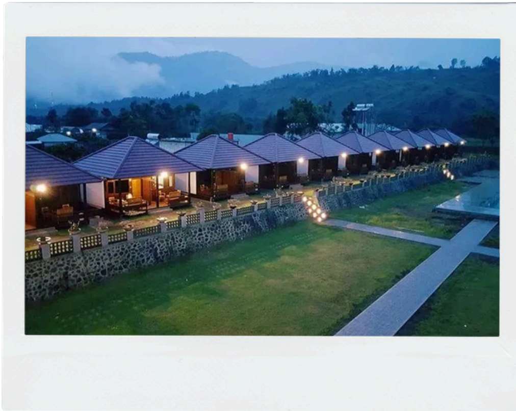
Nusantara Hotel Sembalun

You're in good hands! We've partnered with other local businesses to provide you with a premium experience.