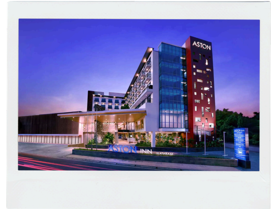
Aston Inn Mataram