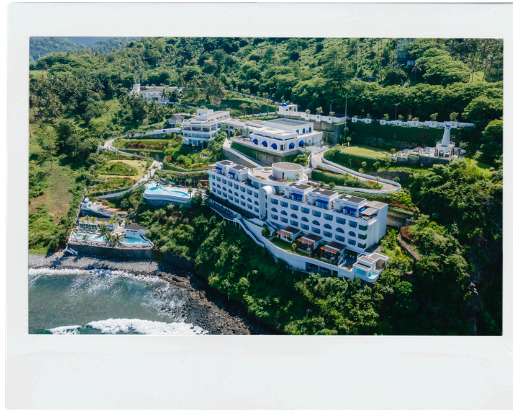
Royal Avila Boutique Resort