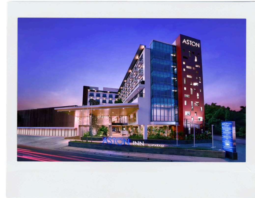
Aston Inn Mataram