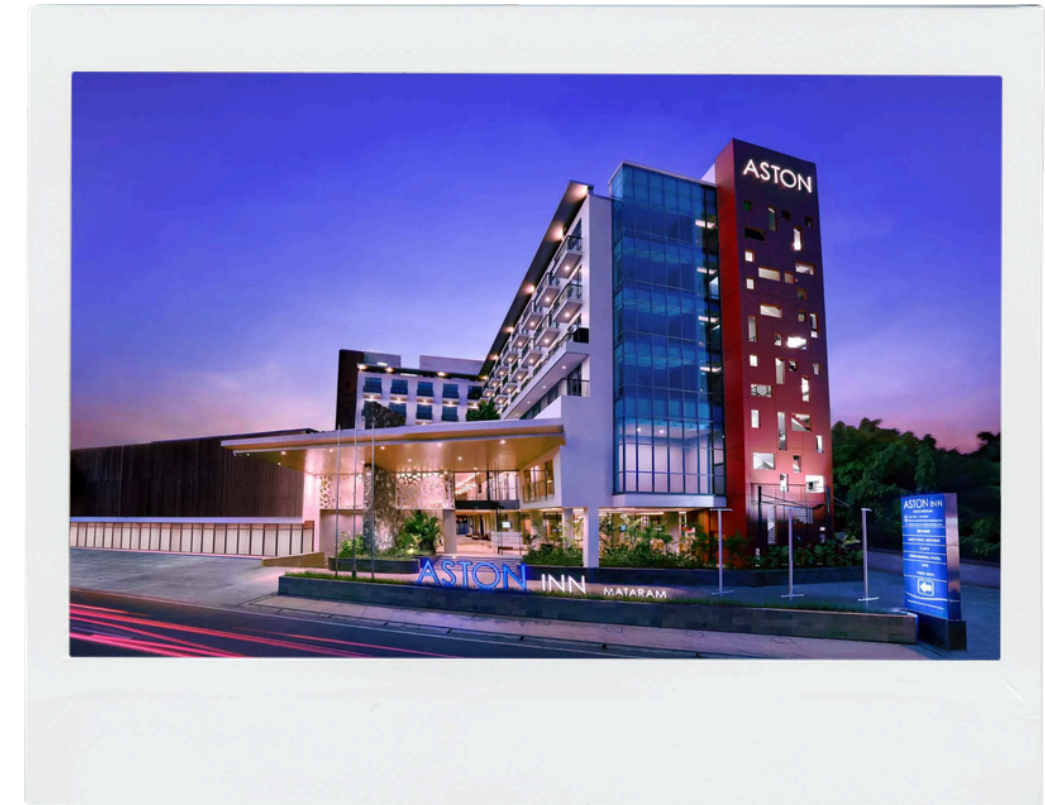
Aston Inn Mataram