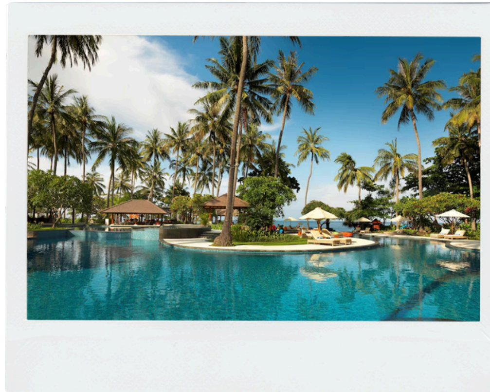
Holiday Resort Sengigi