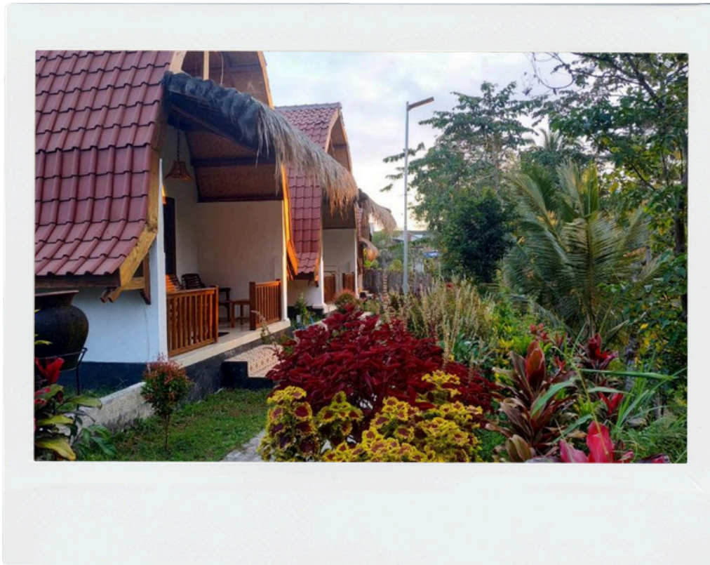
Homestay Kembang Kuning Tourism

You're in good hands! We've partnered with other local businesses to provide you with a premium experience.