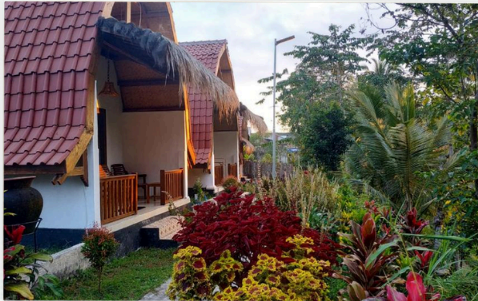
Homestay Kembang Kuning Tourism

You're in good hands! We've partnered with other local businesses to provide you with a premium experience.