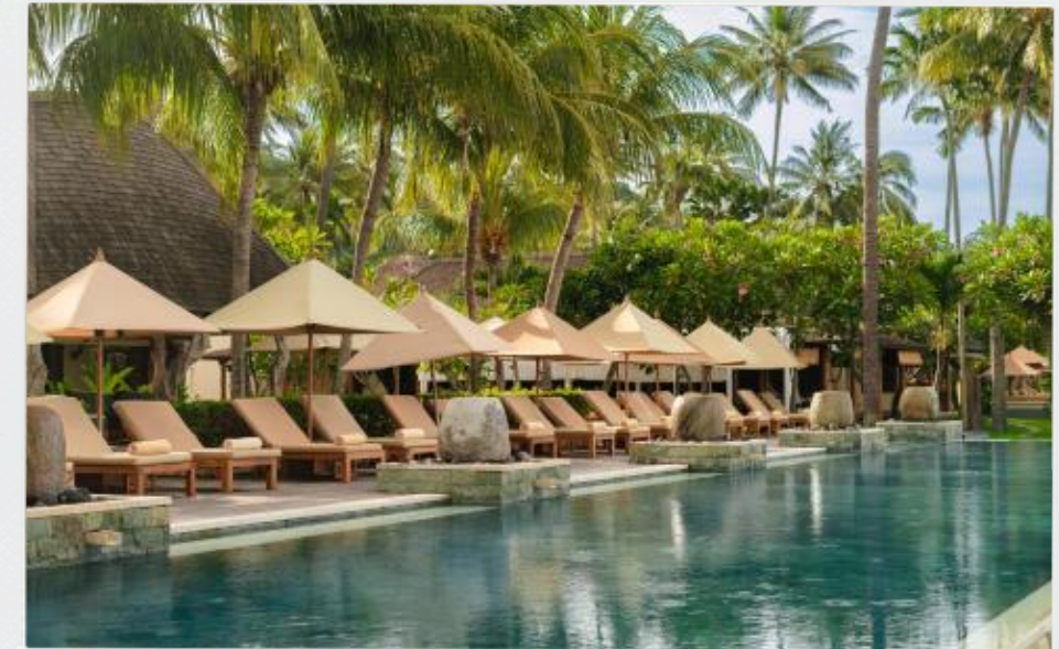
Qunci Villas Senggigi