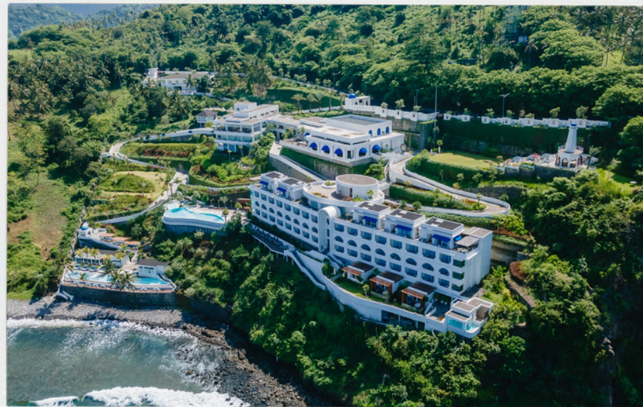
Royal Avila Boutique Resort

You're in good hands! We've partnered with other local businesses to provide you with a premium experience.