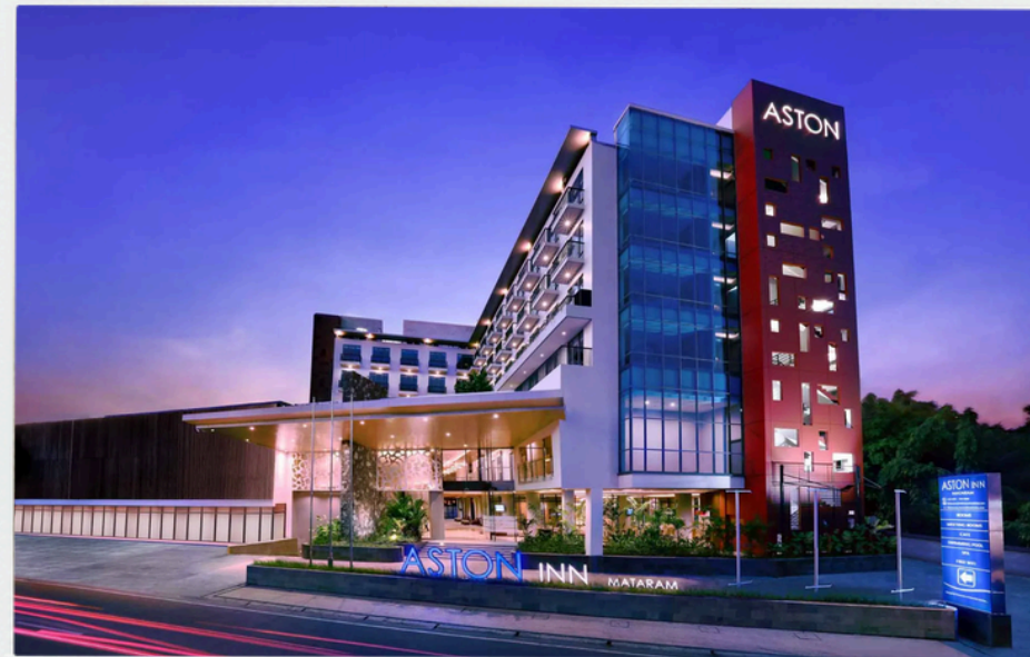
Aston Inn Mataram