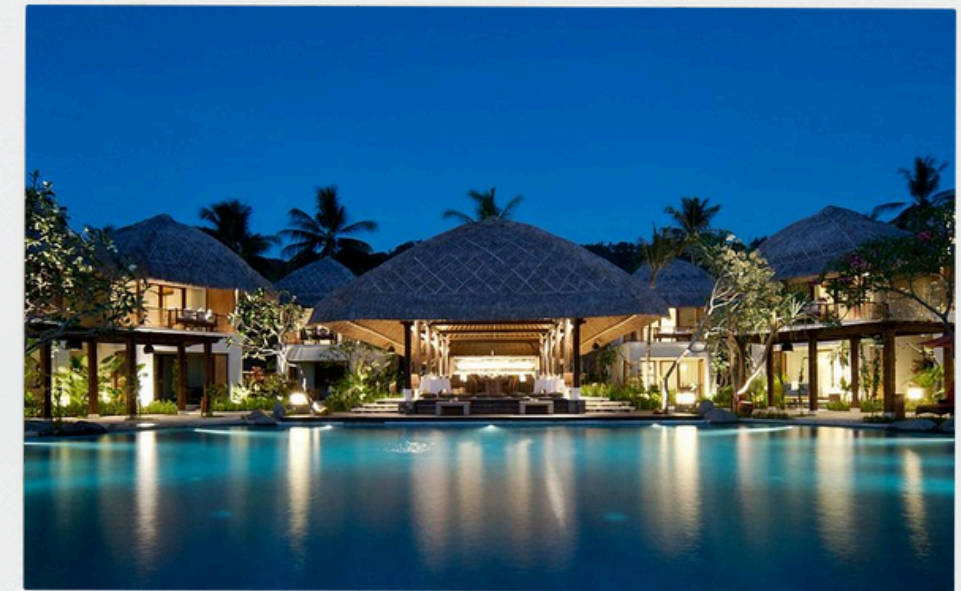
Sudamala Resort Senggigi