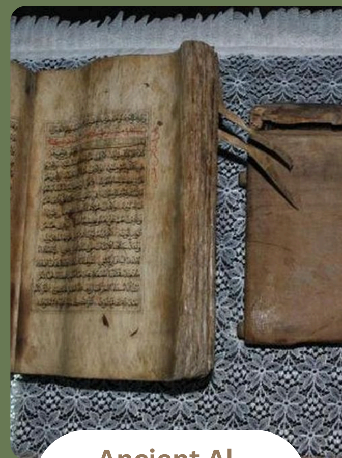
Ancient Al- Qur'an