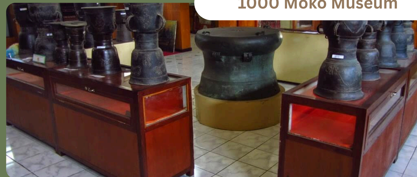
1000 Moko Museum